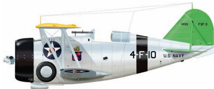
VF-4 Grumman F3F-3. Note the Neutrality Patrol star on the fuselage.

The current VFA-11 traces its roots back to 1950 with the establishment of VF-43 Rebel's Raiders , flying F4U-5N and F4U-5 Corsairs . In 1959, the squadron was redesignated as VF-11 and adopted the name Red Rippers following the disestablishment of a squadron bearing that designation and name. Since 1959, the Red Rippers have flown the F-8 Crusader , F-4 Phantom II , F-14 Tomcat and recently transitioned to the F/A-18 Super Hornet . With this transition, the squadron changed its designation to VFA-11. The "Boar's Head" logo worn by the Red Rippers can be traced through various squadrons back to 1927.