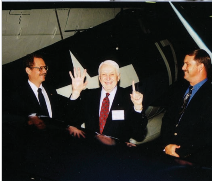
On 19 June 1944, LTJG Alex Vraciu (center) shot down six enemy aircraft to become an "ace in a day". The top photo was snapped shortly after landing. The lower photo was taken at the Naval Aviation Symposium in Pensacola in May 2002.