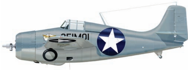
Grumman F4F-3P Wildcat assigned to VMO-251 in the Solomons

While no longer known as VMO-251, the squadron is still operational and is currently flying the F/A-18C Hornet .