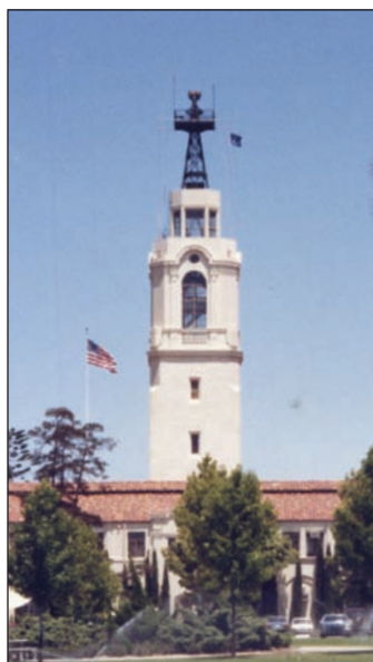
Commander, Naval Air Forces Headquarters building, constructed in 1918-1920 at Naval Air Station North Island.